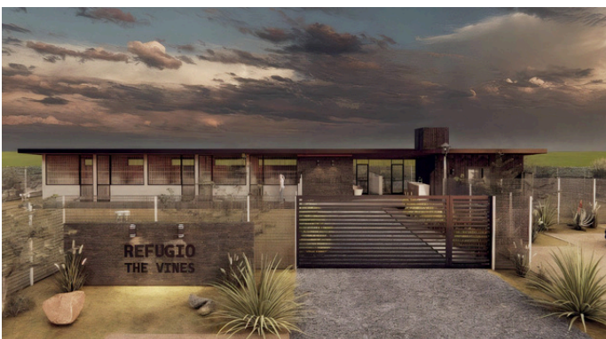
New Shelter Design by Federico Velazco (render)

We're thrilled to announce this revitalized project is now in full swing! This transformation wouldn't be possible without the incredibly generous donations from our dog-loving community, who upon learning about the urgency to relocate, immediately stepped forward to support us.