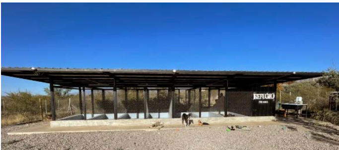
Current Animal Shelter, built in Feb 2021