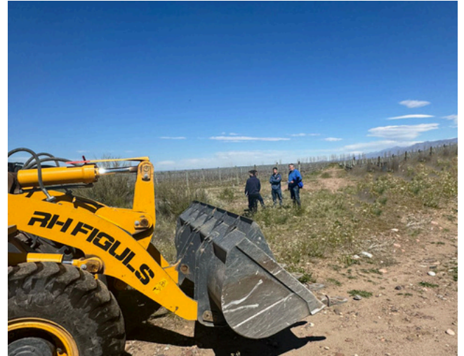
The backhoe beginning the earthmoving work