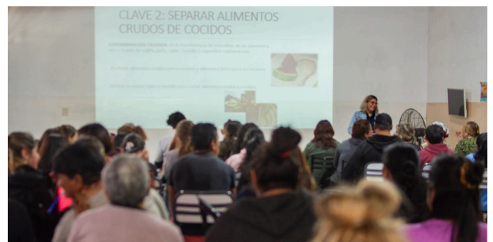
The Food Handling Course took place in a classroom at the CIC in Tunuyán.

Held over two half-day sessions and taught by Tunuyán's Food Safety Department, the course combined theoretical and practical learning. Participants completed a final exam to earn their official Food Handling Certificate, valid nationwide for three years.